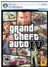
Grand Theft Auto IV (PC)