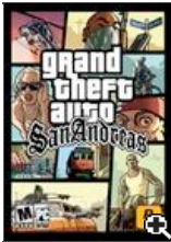
Grand Theft Auto: San Andreas

Rockstar Games Rockstar North Modern Action Adventure Release: Jun 7, 2005 » ESRB: Mature