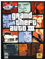
Grand Theft Auto III (PC)