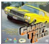
Grand Theft Auto (PC)