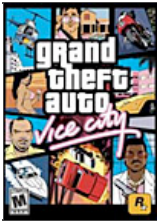
GTA: Vice City (PC)