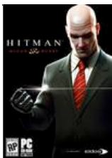
Hitman: Blood Money (PC)